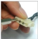
Put the pin extractor into housing

Designed for use with various connectors such as MOLEX, AMP, TYCO, etc. Quickly and easily extract crimped pins from their housing. Other sizes available (sold separately).