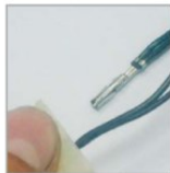
Extract the pin