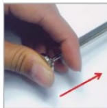
Push the plunger of pin extractor