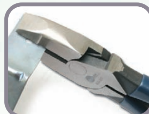
Firm gripping power