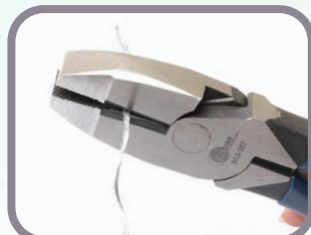
Cut Piano wire 2.5mm (.10")