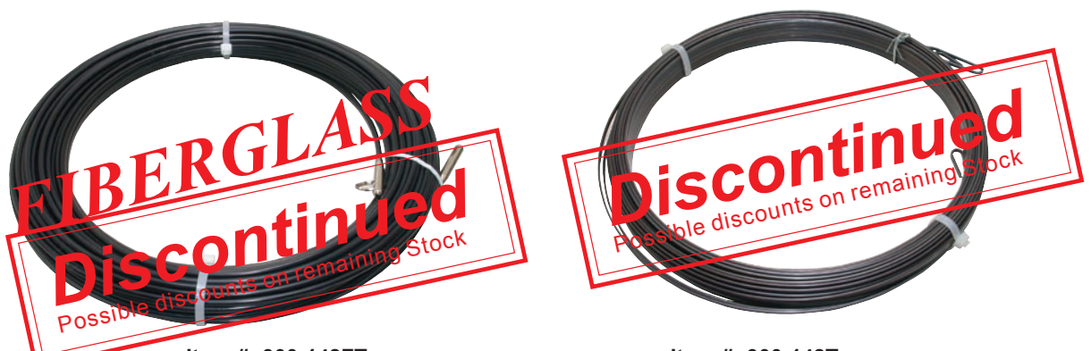
Item #: 900-148FT