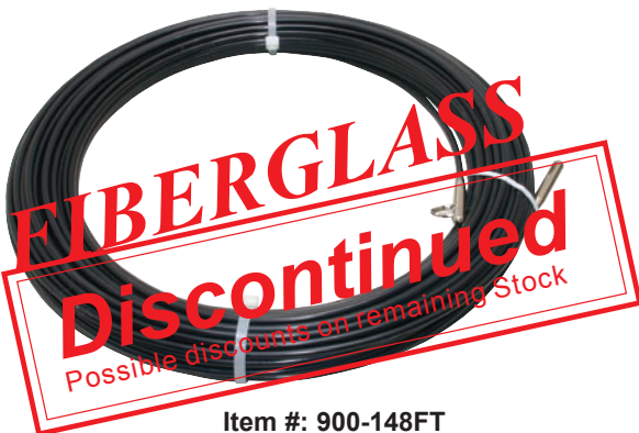
Item #: 900-148FT