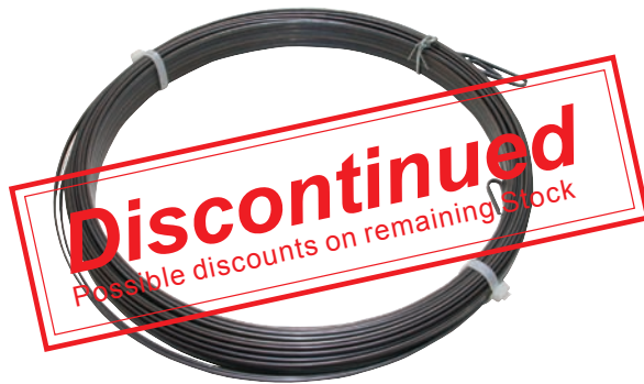
Item #: 900-148T