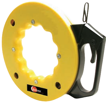
Item #: 900-147