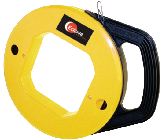
Item #: 900-149