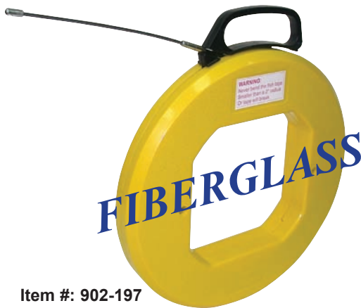
Item #: 902-197