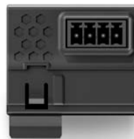
RS485 interface - Black