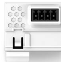
RS485 interface - White