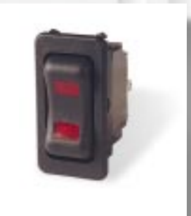
8005K21N319V22 Full Size