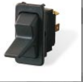
8004K23N6V2 Full Size