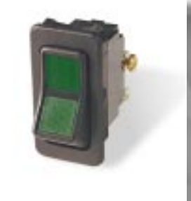
8005K25N315V32 Full Size