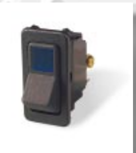
8005K21N319V62 Full Size