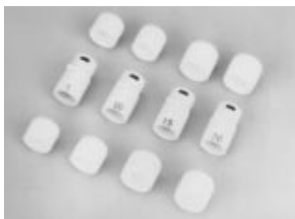
Biconic Single-mode Attenuators