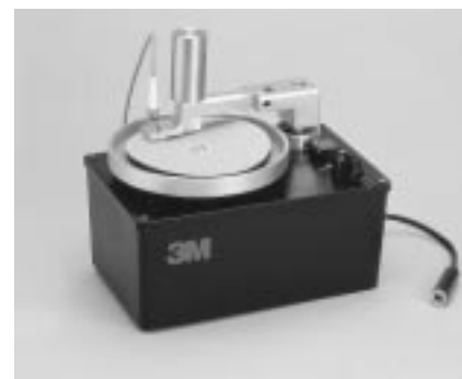
6850 One Step Polishing Machine

3M also offers connector termination kits utilizing the one-step polishing procedure for a variety of hot melt connectors. The 6150-A and 6151-A Termination Kits contain all materials necessary to terminate either