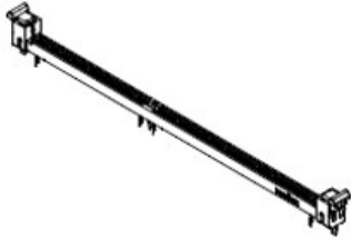
Series image - Reference only

1mmDDR3TH VT110SP VLP LLLCR.38AuLF240Ckt