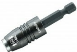
CentroFix 1/4" Quick Release Bit Holder