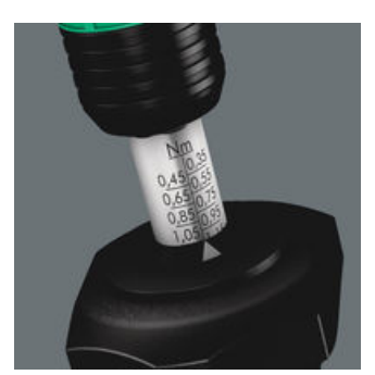
Easy-to-read scale value.