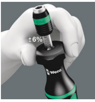
Measurement accuracy is \pm 6 % in accordance with the standard DIN EN ISO 6789. Distinctly audible and noticeable excess-load signal when the pre-set torque is reached.