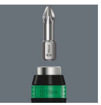
Rapidaptor technology makes the tool adaptable since bits and sockets can be exchanged rapidly.