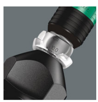
Articles 7430, 7431 and 7432 all come with a magnifying glass. This can be easily attached on to the scale, dramatically improving visibility.