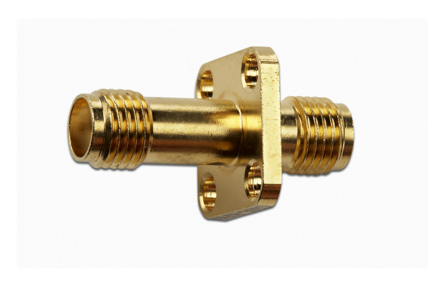
Model 72973 SMA JACK (F) TO JACK (F), PANEL