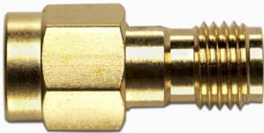
Model 72967 SMA JACK (F) / JACK (F), REVERSE POLARITY

High bandwidth, small size, and durability for confident connections