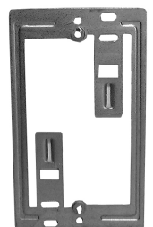
No. 72-4100B Retrofit Bracket BULK PACKED ONLY

This bracket is designed for ALL Low Voltage applications. It fits into EXISTING CONSTRUCTION by cutting a hole in the wall and bending the tabs securing the bracket. Then the wall plate is mounted on this bracket.