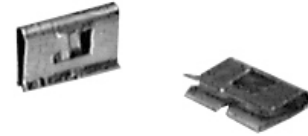
No. 72-6602 Bridging Clips (100 pk)

The clips press onto the center slots of the “66” Block and allow the left pair and the right pair to be connected together. Example; If you terminate the incoming station cable pairs on the left and the equipment wiring on the right hand pair, then by use of the bridging clip they are connected.