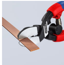
Clean, flush cutting of copper conductor rails