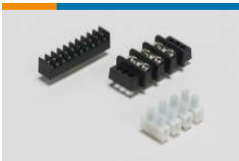
Barrier Strips (2135)