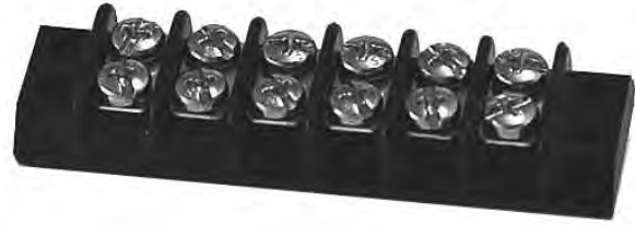
106 / 670A GP 06