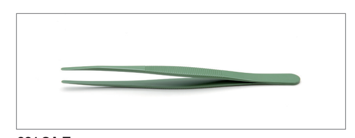
321.SA.T Teflon coated. Serrated handles. Tips: straight, rounded, flat. OAL: 120mm