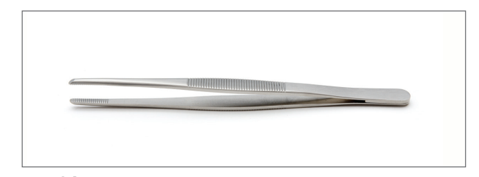
475.SA Serrated handles. Tips: straight, strong, blunt, line serrated. OAL: 135mm