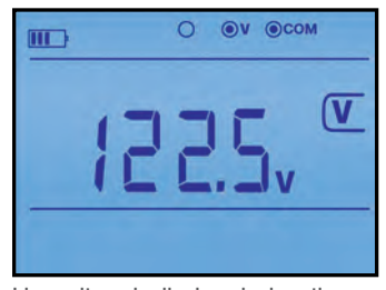
Live voltage is displayed when the V/A function is selected and test leads are connected to AC or DC voltage.