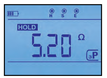
3P mode used for measuring the grounding system. The resistance of the injector electrode and the test voltage are also displayed.