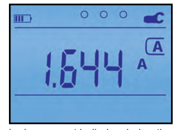
Leakage current is displayed when the optional MN72 probe is connected and the V/A function is selected