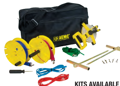
KITS AVAILABLE SHOWN: CATALOG #2135.35