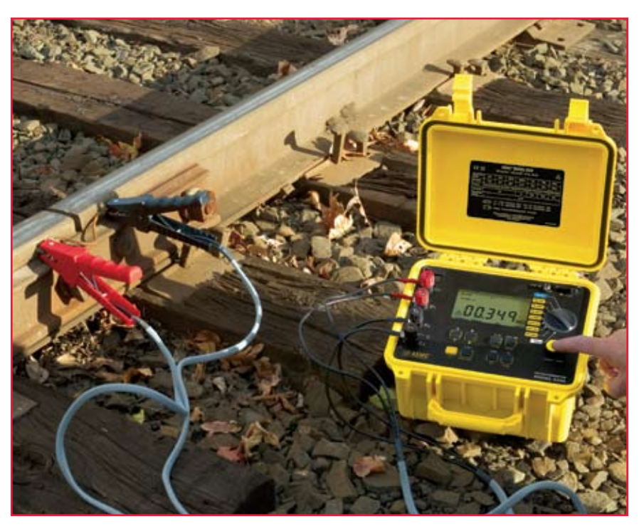
Verifying rail bonds with the Model 6250