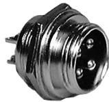
Mounting Hole is 5/8" D