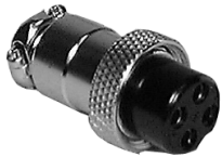
1-7/16" X 1/2" D, 23/32" D Ret. Ring