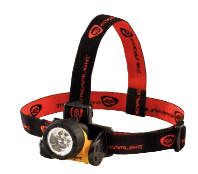
A wide flood pattern illuminates your work area

Case Material: Tough ABS thermoplastic construction with elastomer over mold; polycarbonate lens