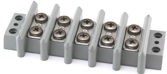
(5 Pole shown)

Insulator Strip Required for Voltage Rating