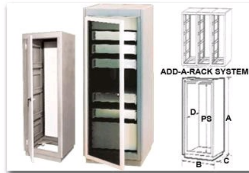
Click on Image for Larger View