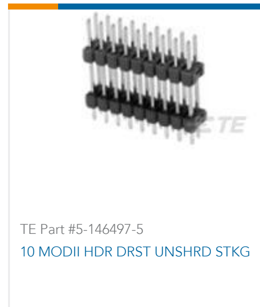
TE Part #5-146497-5 10 MODII HDR DRST UNSHRD STKG