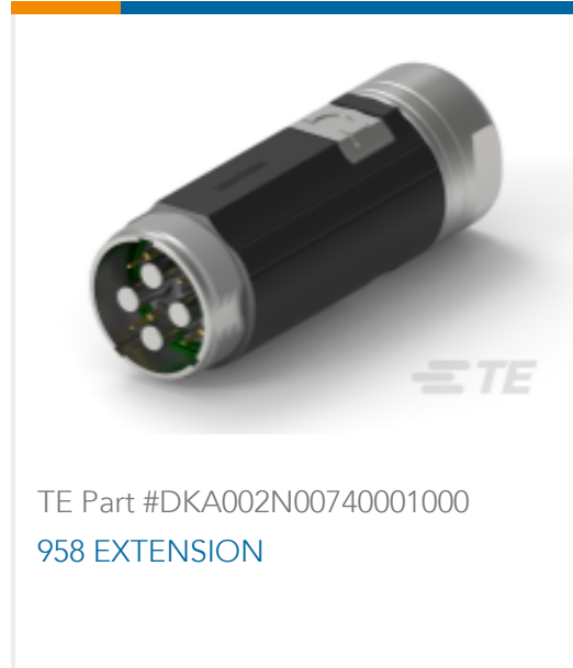
TE Part #DKA002N00740001000 958 EXTENSION