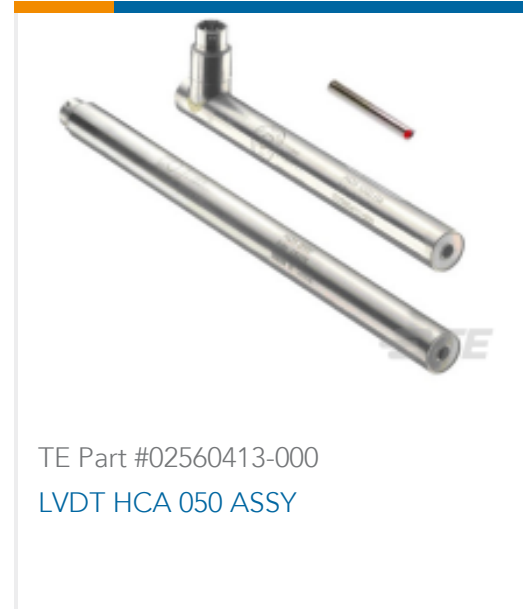
TE Part #02560413-000 LVDT HCA 050 ASSY