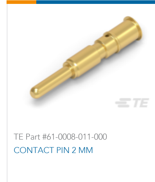
TE Part #61-0008-011-000 CONTACT PIN 2 MM