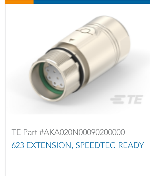
TE Part #AKA020N00090200000 623 EXTENSION, SPEEDTEC-READY