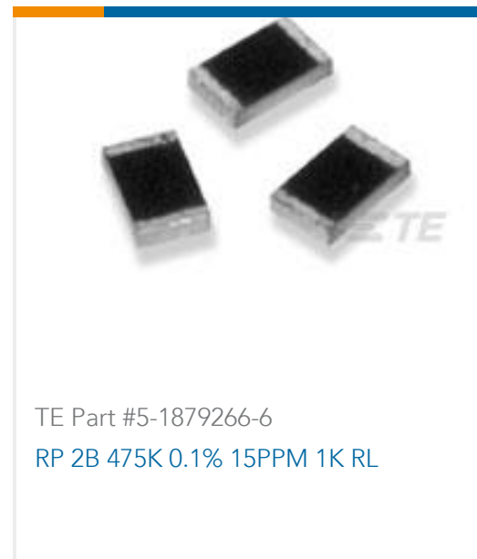
TE Part #5-1879266-6 RP 2B 475K 0.1% 15PPM 1K RL