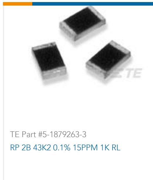
TE Part #5-1879263-3 RP 2B 43K2 0.1% 15PPM 1K RL