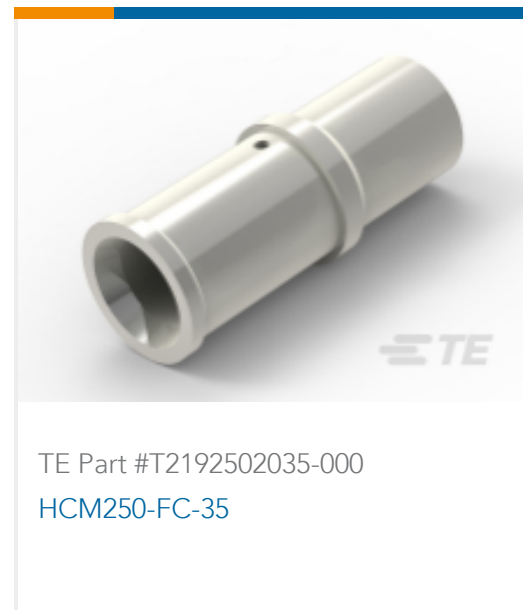
TE Part #T2192502035-000 HCM250-FC-35