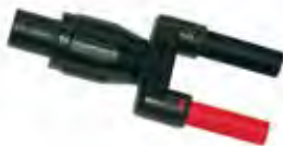
Banana (female) - BNC (male) Adaptor Catalog #2118.46 (optional)

**Available as special orders only. Contact customer service for current list price.