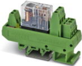
VARIOFACE relay module, pluggable, 2PDT

Please be informed that the data shown in this PDF Document is generated from our Online Catalog. Please find the complete data in the user's documentation. Our General Terms of Use for Downloads are valid ( http://phoenixcontact.com/download )