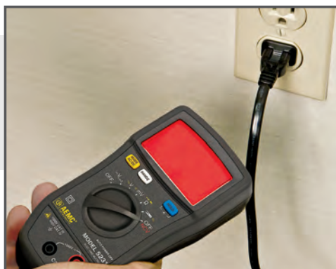
Non-contact detection of network voltage (NCV Function-AC only)