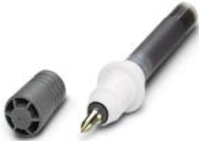
Marker pen, color: black

Please be informed that the data shown in this PDF Document is generated from our Online Catalog. Please find the complete data in the user's documentation. Our General Terms of Use for Downloads are valid ( http://phoenixcontact.com/download )