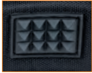
Rubber feet protect the bottom surface from the elements.