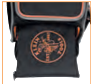
Removable zipper bag designed to fit compartment underneath.