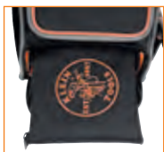
Removable zipper bag designed to fit compartment underneath.