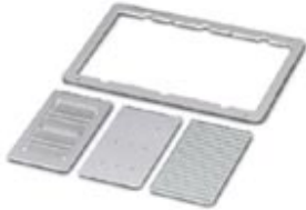
Magazine insert, for CMS-WMU, accepts: 3 PABA marker bars

Please be informed that the data shown in this PDF Document is generated from our Online Catalog. Please find the complete data in the user's documentation. Our General Terms of Use for Downloads are valid ( http://phoenixcontact.com/download )