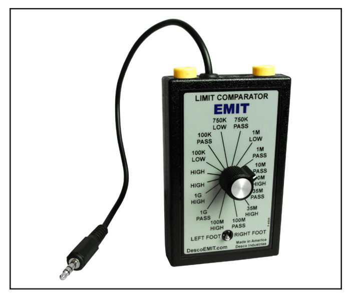
Figure 4. EMIT 50424 Limit Comparator