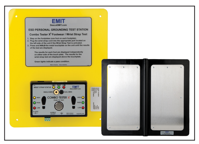
Figure 1. EMIT Dual Independent Footwear and Wrist Strap Tester and Dual Foot Plate