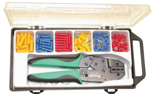
Crimper only – 300-002