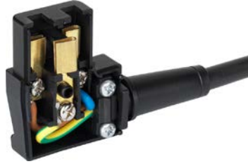
Example with assembled cable