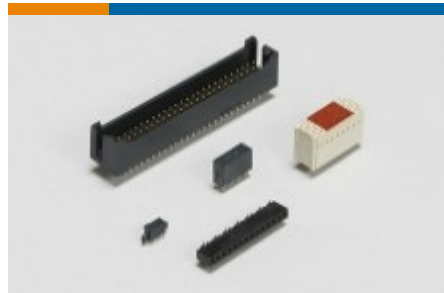
Board-to-Board Headers & Receptacles (130)