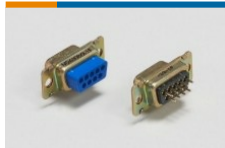
Box Mount D-Sub Connectors (1)