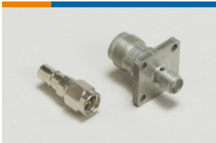
Between Series Adapters (1)