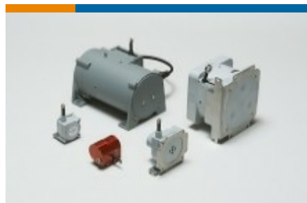
Cable Actuated Position Sensors (17)