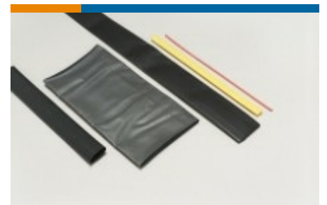
Heat Shrink Tubing (148)