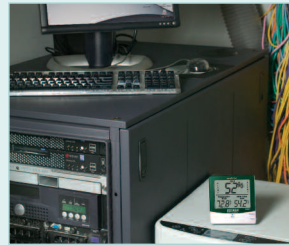
Alerts low Humidity levels in Computer rooms to help prevent electrostatic conditions.