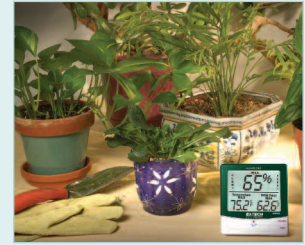
Checks the Humidity and Temperature levels for optimal plant growth in greenhouses.