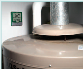
Monitoring Dew Point levels in a Basement for potential mold growth.