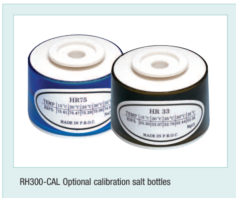
RH300-CAL Optional calibration salt bottles