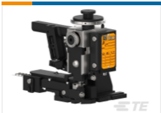
TE Part # 2266354-1 OCEAN_2.0_Applicator-S-055F1100