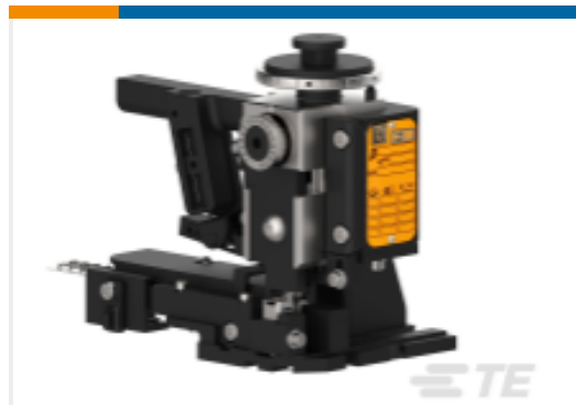
TE Part # 2151721-1 OC-AT-S-FM-080F138F-001-0239