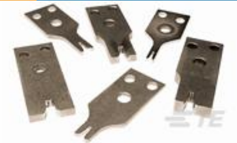
TE Part #1803018-3 CRIMPER, INSUL O