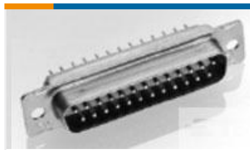
TE Part #205164-1 AMPLIMITE, ASY, PLUG, STD, 109, 2