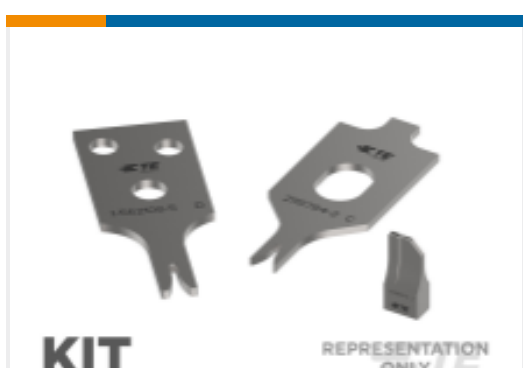
TE Part # 7-2266506-7 OCEAN_2.0_SPARE_PART_KIT-055F067O