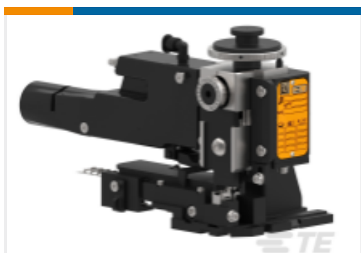
TE Part # 2266506-2 OCEAN_2.0_Applicator-S-055F067O