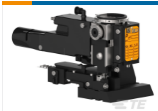
TE Part # 2-2266354-2 OCEAN_2.0_Applicator-S-055F1100