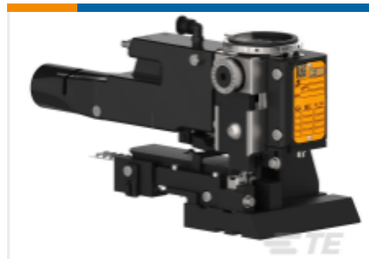
TE Part # 2-2266506-2 OCEAN_2.0_Applicator-S-055F067O