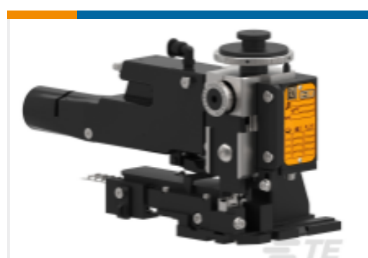
TE Part # 2836118-2 OCEAN-2.0-APPLICATOR-S-055FA