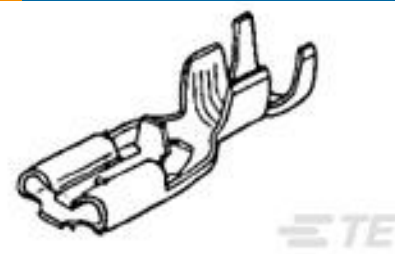
TE Part #170324-2 PL 187 RECEPTACLE 24-20 AWG 0.3 NPCU