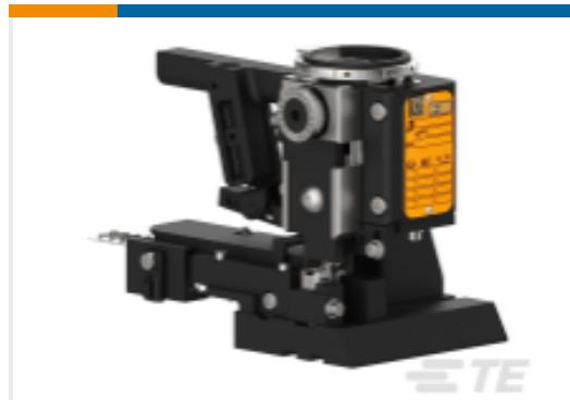
TE Part # 2-2266354-1 OCEAN_2.0_Applicator-S-055F1100