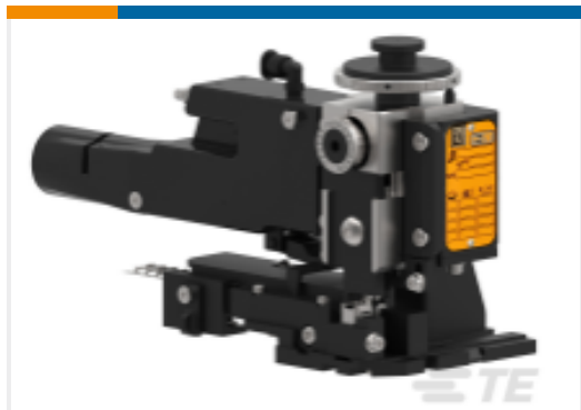
TE Part # 2151721-2 OC-AT-S-FA-055F098F-001-0239