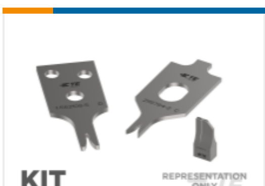
TE Part # 7-2266936-7 OC-055F062F-CRIMP TOOLING KIT