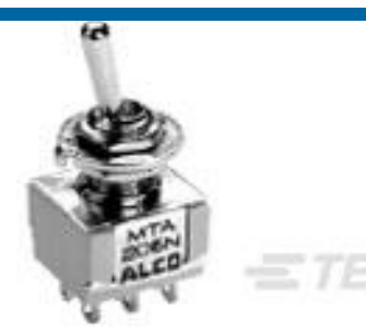
TE Part #3-1437559-9 MTL206P=(MSTL) SW TOG LOCKING