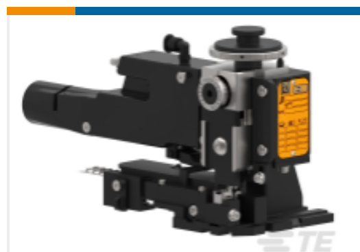
TE Part # 2266354-2 OCEAN_2.0_Applicator-S-055F1100