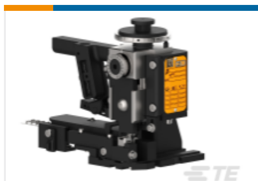
TE Part # 2266506-1 OCEAN_2.0_Applicator-S-055F067O