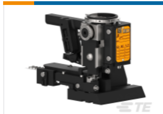
TE Part # 2-2151721-1 OC-PA-S-FM-055F098F-001-0239