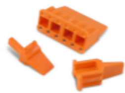
TE Part #WM-2SB DEUTSCH DTM WEDGELOCKS