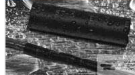
TE Part #121397P013 ES2000-NO.3-B8-0-41MM