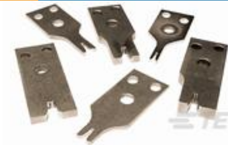
TE Part #2-683453-0 CRIMPER, INSULATION "F" (.070")