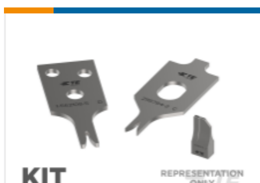
TE Part # 7-2266354-7 OCEAN_2.0_SPARE_PART_KIT-055F1100