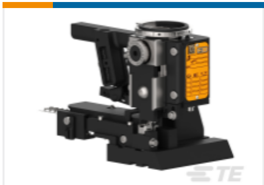
TE Part # 2-2266506-1 OCEAN_2.0_Applicator-S-055F067O