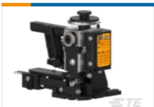
TE Part # 2836118-1 OCEAN-2.0-APPLICATOR-S-055F