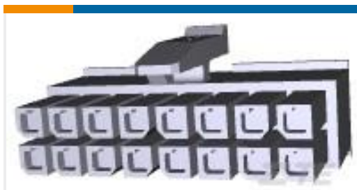
TE Part #1-794617-6 16POS, MICRO MNL, RCPT HSG