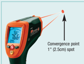
Two laser points converge at a distance of 50"/(127cm) and form a 1" (2.5cm) spot.