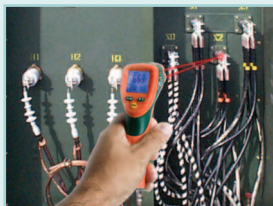
Fast response captures hot spots