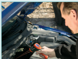
Max hold indicates and holds the peak temperature for easy identification of hot spots