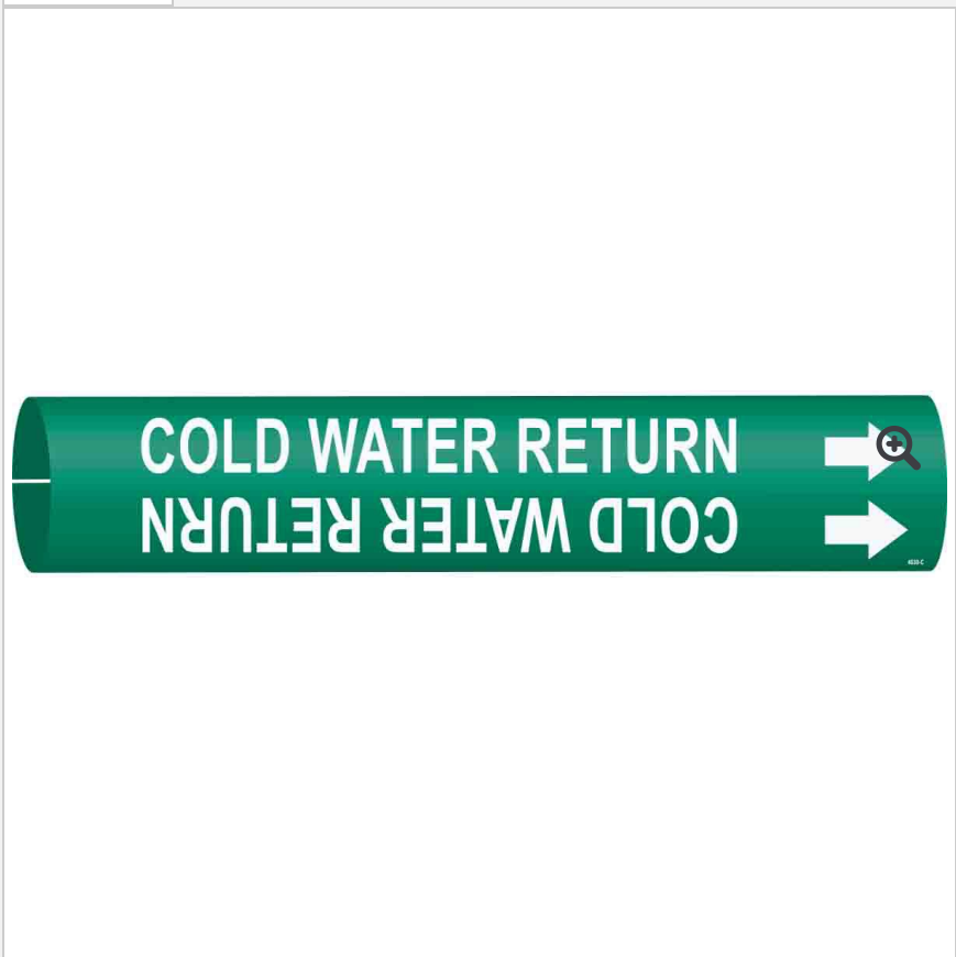
Cold Water Return Pipe Marker