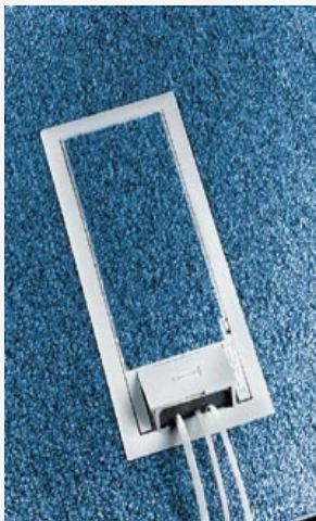
Concealed 3-Service Floor Box Cover Assembly, Black