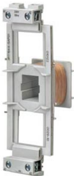
COIL FOR CONTACTORS SIRIUS, SIZE S3, SCREW CONNECTION, AC 220 V, 50 HZ / 240 V, 60 HZ