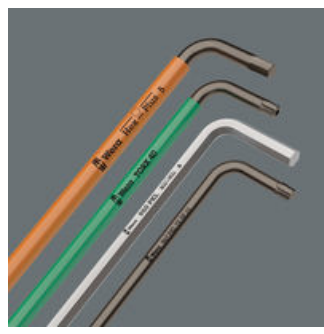
The size of each L-keys has been engraved by a laser. In addition SPKL L-keys have a colour coding according to sizes – for simple and rapid accessing of the required tool. Making it easy to find the right tool.