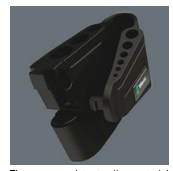
The wear-resistant clip material ensures that the L-keys are securely held yet are easy to remove.