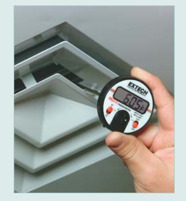
Stem thermometer ideal for measuring temperature in HVAC applications such as air ducts, vents, and heaters.