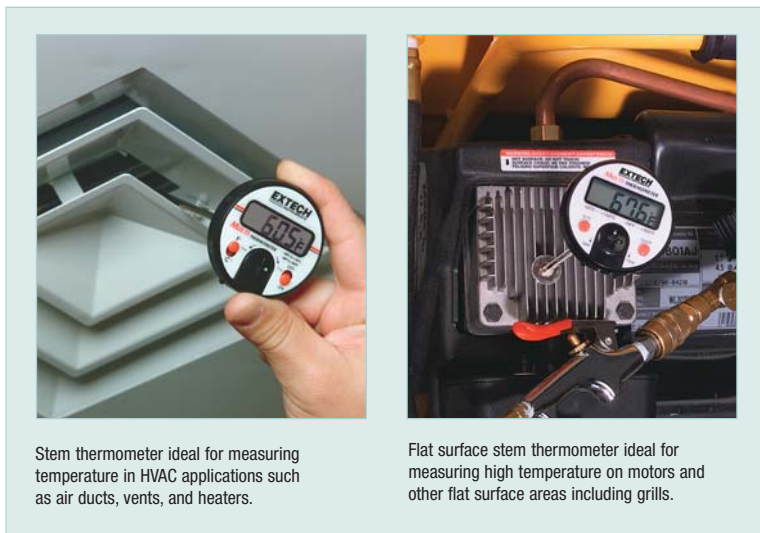
Stem thermometer ideal for measuring temperature in HVAC applications such as air ducts, vents, and heaters.