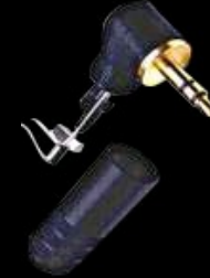
35HD Series Right Angle Plug