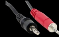
3.5mm (1/8" Mini) Overmolded Cable