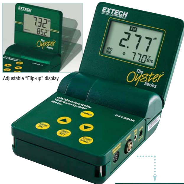
Adjustable “Flip-up” display