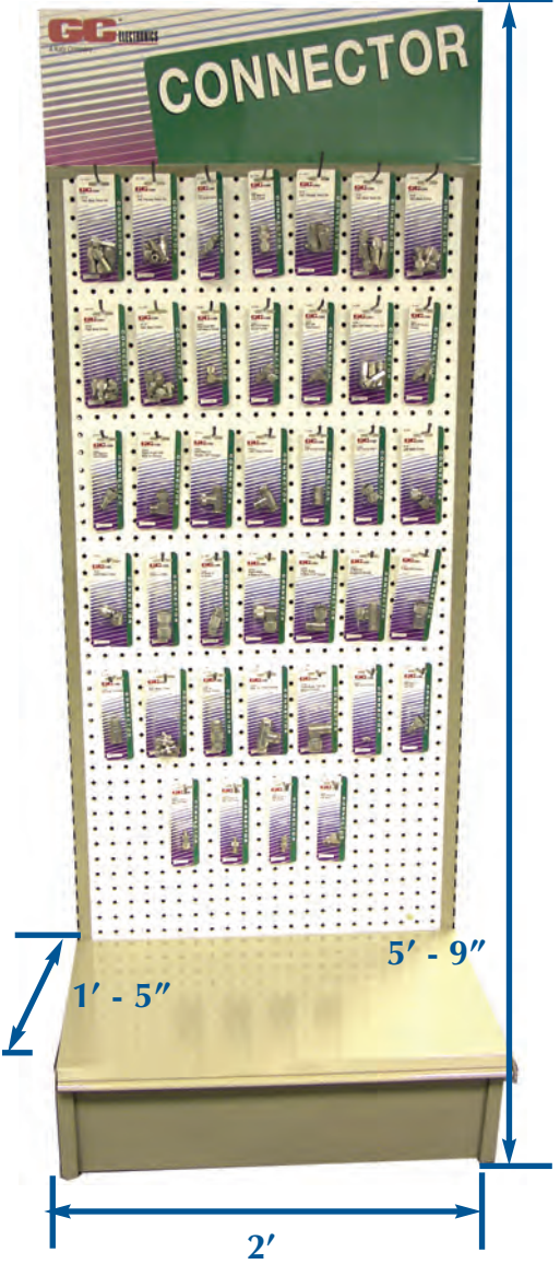
Display Rack Part No. 49-3315