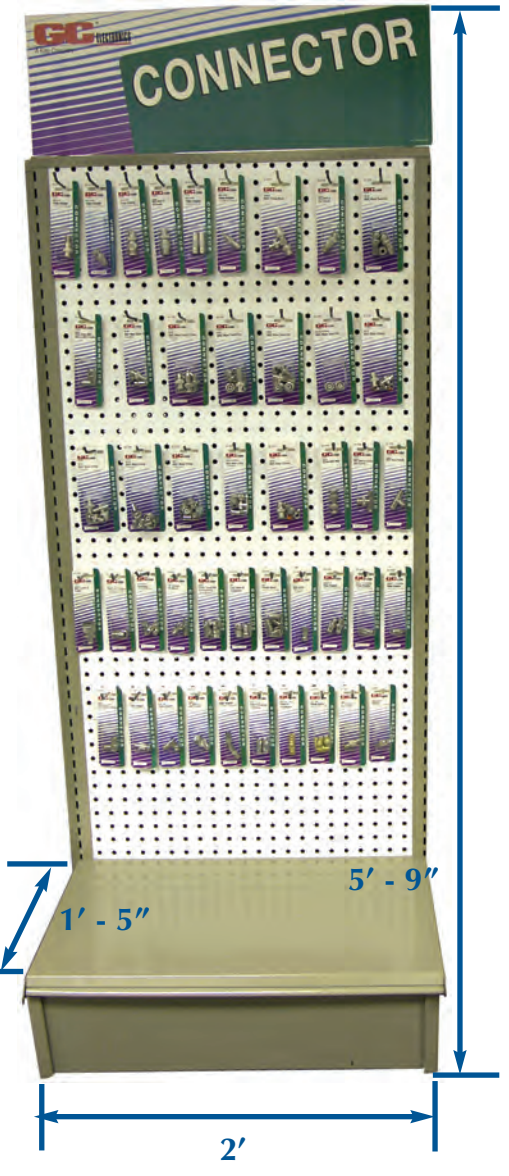
Display Rack Part No. 49-3310