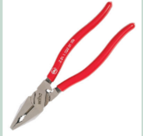
Lineman's Pliers With Crimper For Standard Connectors 9" 22.5mm