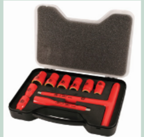
11 Piece Insulated 3/8" T-handle & Socket Set - Metric