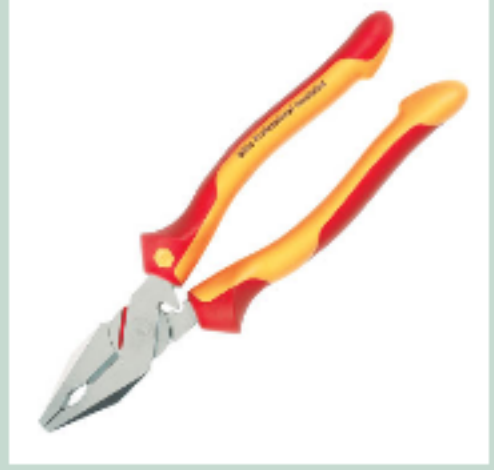
Insulated 9" Lineman's Pliers With Crimper