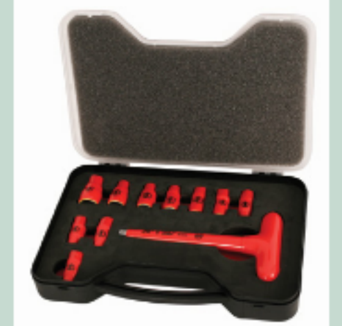
11 Piece Insulated 1/4" Metric T-Handle Socket Set