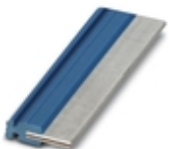
Plug-in bridge, length: 50 mm, color: blue

Plug-in bridge - FBST 50-PLC BU - 1081051