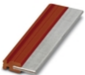
Plug-in bridge, length: 50 mm, color: red

Plug-in bridge - FBST 50-PLC RD - 1081050